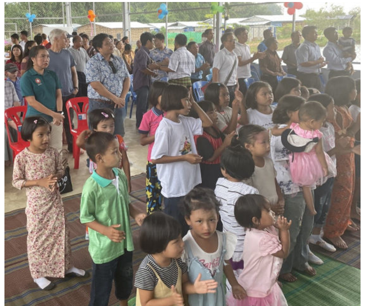
Floating Church Dedication Service