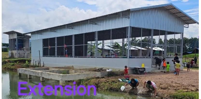
The Floating Church

Hence, the name "Floating Church" became the catchphrase describer of the new building. As the local government got involved things changed, and everyone agreed to move the building onto the land and build a much less expensive structure that would stay within