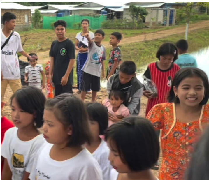
Preparing for the Dedication Service