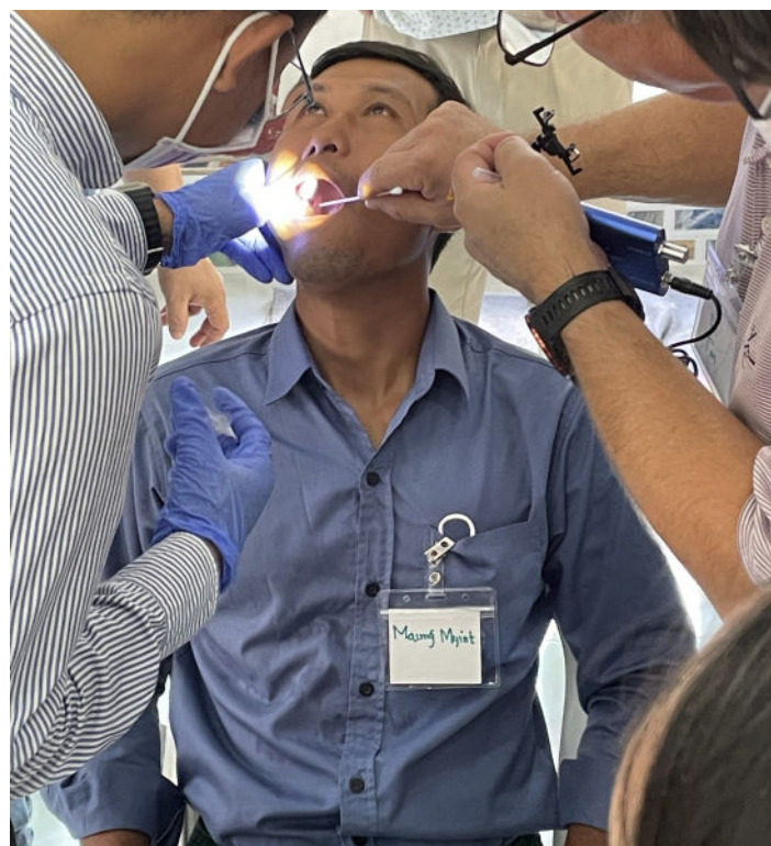
Training a student first