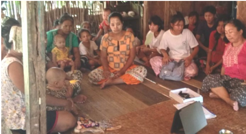
Watching the Jesus Film

With this opportunity comes several new challenges, but the reward will be absolutely worth it! We have not had a tool like this to put into the hands of most of our workers ever before. And the wildly successful track record of our past one year and one-half experience is the greatest motivating factor. Please consider a significant year end gift. Because of the matching fund grant opportunity, your gifts will be doubled. Together we will extend the boundaries of the kingdom and populate heaven with many new people. Thank you for being a teammate with Asia Christian Services in our ongoing ministry of hope!