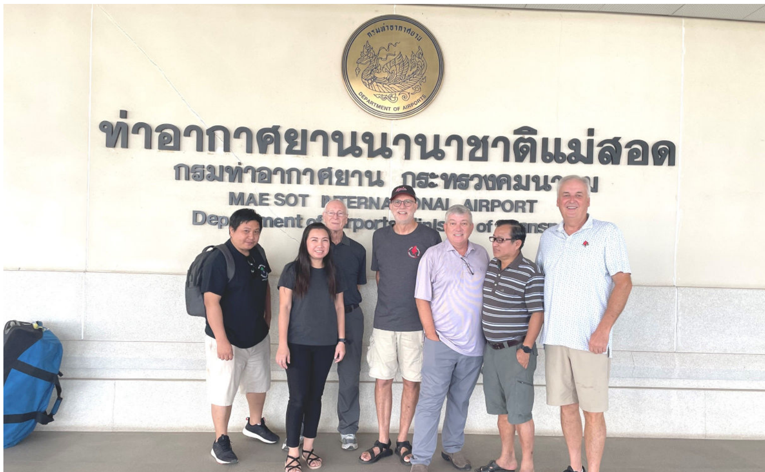
Going Home — A mission well done!

presented with love and each patient went on their way healed and encouraged. The week ended with a graduation and presentation of the dentistry tools that would be needed for a lifetime of ministry. This is a ministry that produces hope. We are very grateful for this important ministry partner and look forward to many further trainings. Thank you mPower Approach!