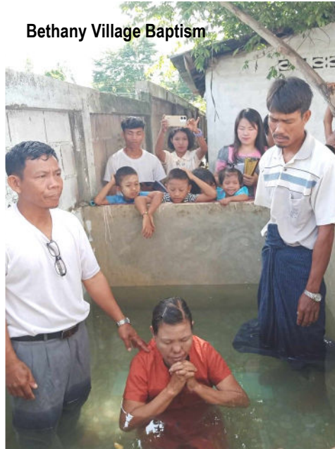
Bethany Village Baptism