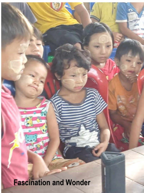
Fascination and Wonder