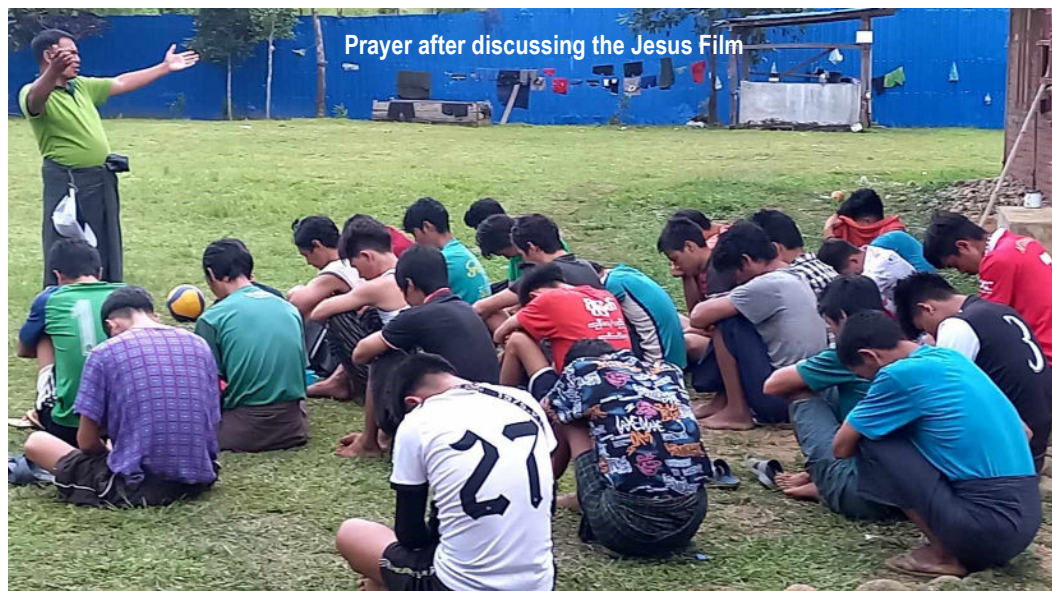
Prayer after discussing the Jesus Film