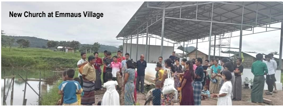
New Church at Emmaus Village