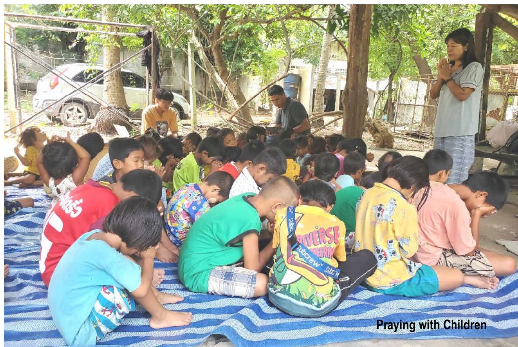
Praying with Children

At ICOM – the International Conference on Missions in the fall of 2023, we discovered a mission that distributes tablets for the Jesus Film at a very affordable price. At that time, we also received a donation from GNPI – Good News Productions International -- of three solar powered battery projectors that could show the Jesus film on screens to audiences of 100 or more. In January of this year at the Golden Triangle Seminar, we secured commitments from 110 evangelists to show the Jesus Film at least 25 times to groups of refugees in order to receive a new tablet. By April, those tablets had been distributed to be used primarily in Myanmar.