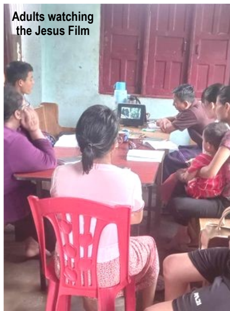
Adults watching the Jesus Film