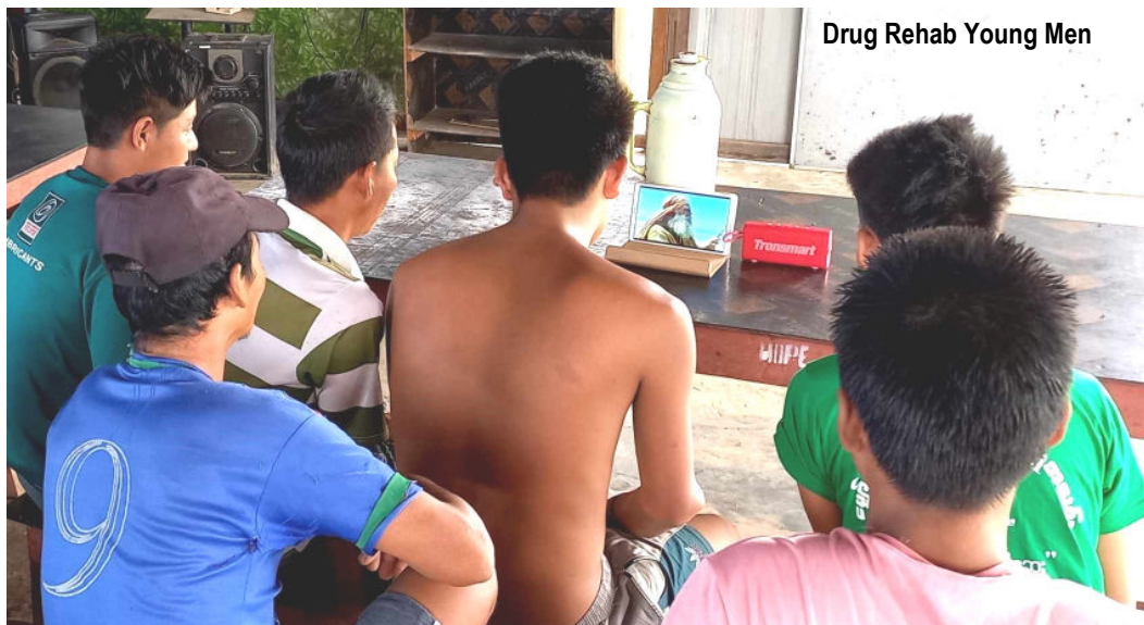
Drug Rehab Young Men