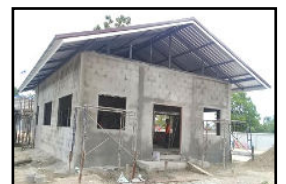
New Stadia Church at the MaeSot Trash Dump