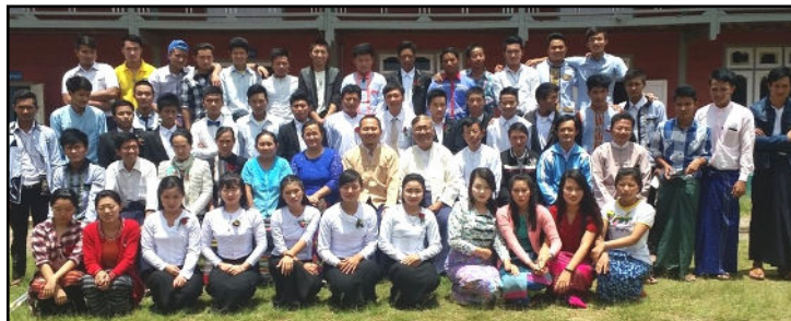
TBC Faculty and Students—2018

Manasseh established Taunggyi Christian Center and later launched Taunggyi Bible College. The graduates are now reaching nine previously unreached tribes with new church planting.