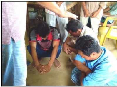
Three New Deacons

"Attached you will find some pictures taken last Sunday where we appointed three new deacons for Punyabhum Coc among the Chackma Christians. Earlier we had only one deacon for this church. With these four deacons along with the local pastor, they will serve the