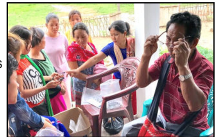
Giving new glasses in NE India