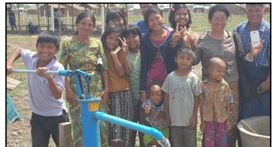
A New Well

4. THE GOT WELLS PROJECT – The Worthington Christian Church raised funds for the "GOT WELLS" Project and we drilled 35 Wells for needy villages. They came to know God is good. We hope and pray that they will accept God's grace someday.