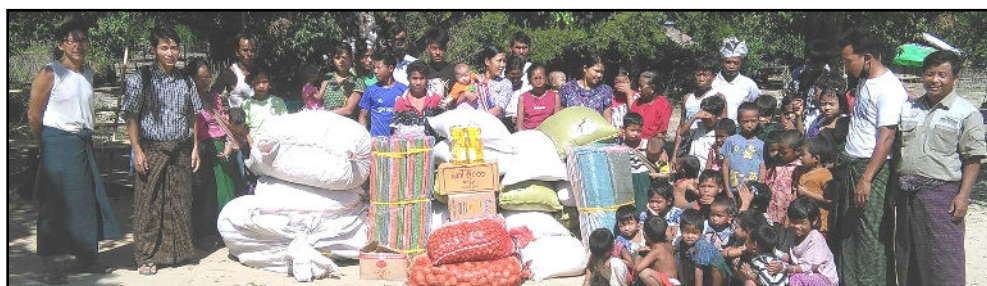
Rakhine State Aid