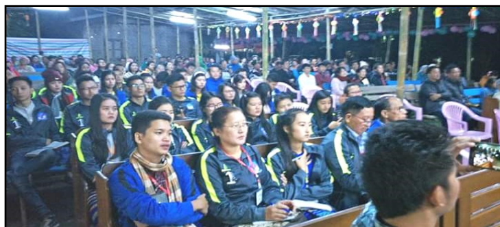
2016 Christmas Convention with 20,000 Lisu

In the north, a special bamboo structure is built to accommodate thousands of attendees. This year the Lisu people alone are expecting again over 20,000 for their Christmas gathering. Unlike our conventions in the USA, those attending are not staying in hotels or eating in restaurants, but rather they are basically camping. They bring their chickens, pigs, vegetables and rice with them to the gathering and they butcher them as they are needed for the upcoming meals. There is no refrigeration and so everything is prepared as needed. Their plates are banana leaves and their feasts lack nothing. Their celebration is joyful and they celebrate coming out of “darkness into the dawning” of the light of Jesus.