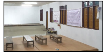
New Grace Preschool Space