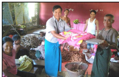
Rakhine State Refugees Receiving Help