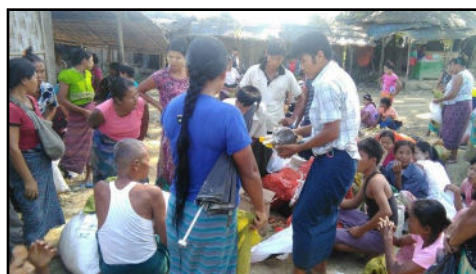
Rakhine State Refugees