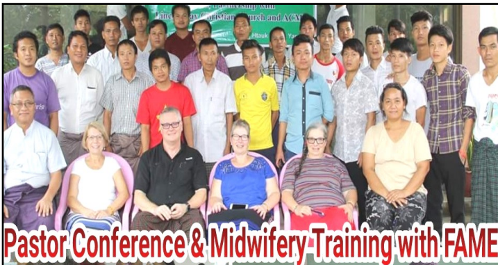
Pastor Conference & Midwifery Training with FAME