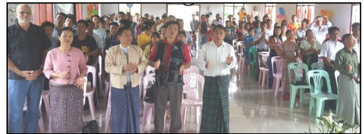
Grace Dedication Service

4. THE GOT WELLS PROJECT – The Worthington Christian Church raised funds for the "GOT WELLS" Project and we drilled 35 Wells for needy villages. They came to know God is good. We hope and pray that they will accept God's grace someday.