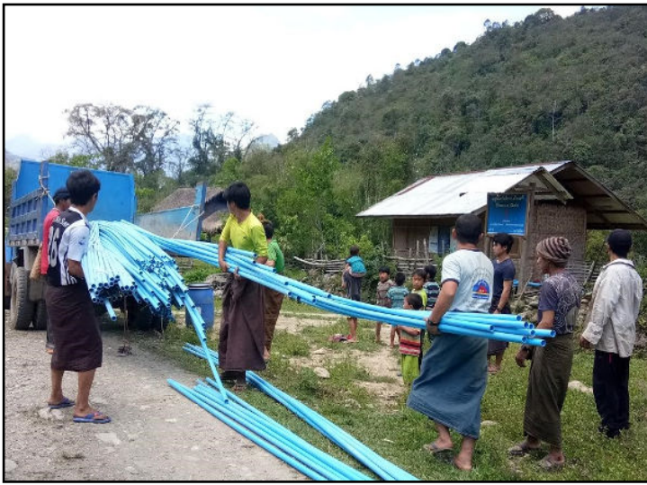
New Pipes for the Project

Gumling village alone. I bought all PVC pipes and accessories plus steels and cements. We found out that Nambandam village