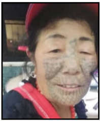
Tatoo Dulong Girl

Our fellow Evangelists taught Jesus sacrificed ONCE FOR ALL and many evil spirit worshippers accepted Jesus Christ. There are over 300,000 Believers and 900 churches in the Kuming, China area. Praise the Lord!