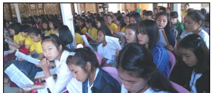
The Teenage Girls Attending the Seminar