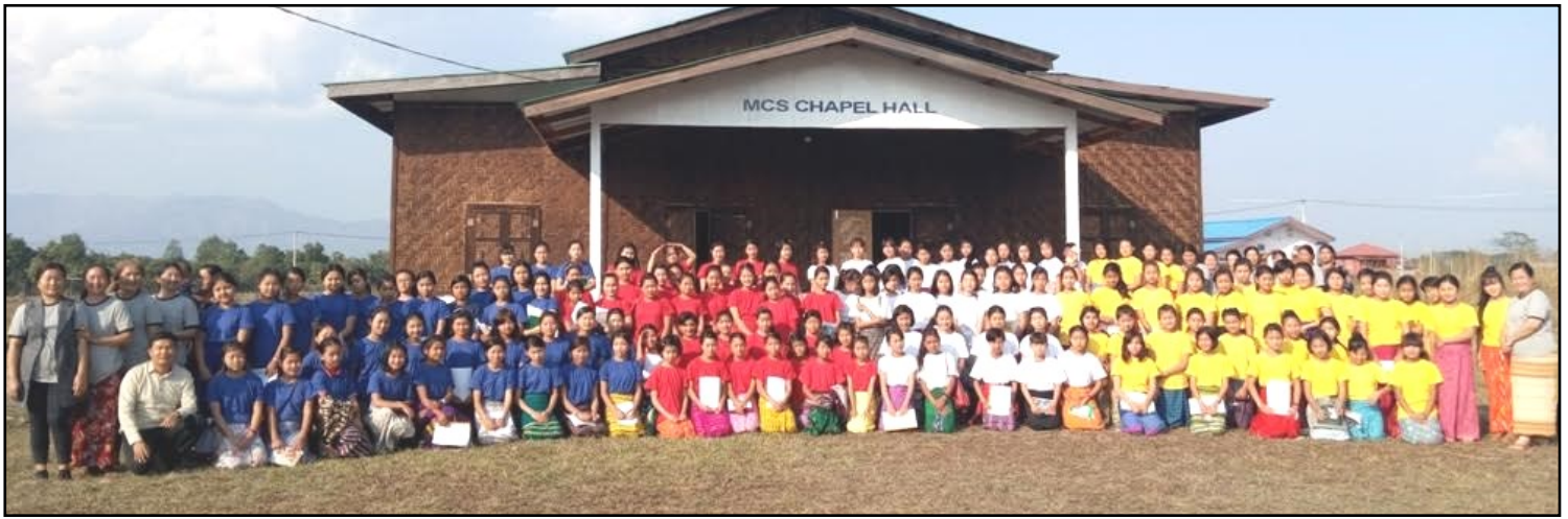
The Teenage Girls Seminar