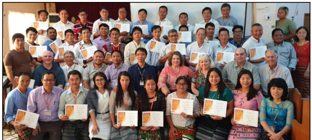
The Kairos Seminar Graduates