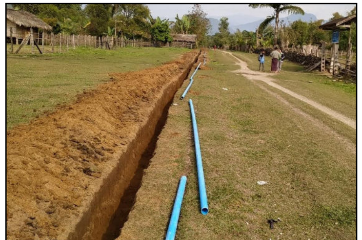
Pipes for the Water Project

I had to go back to Nongmung for water project which is sponsored by IDES. The primary purpose was only for