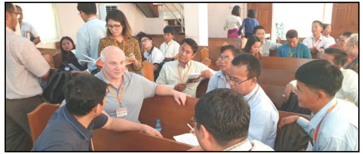
Kairos students discussing an application to the training