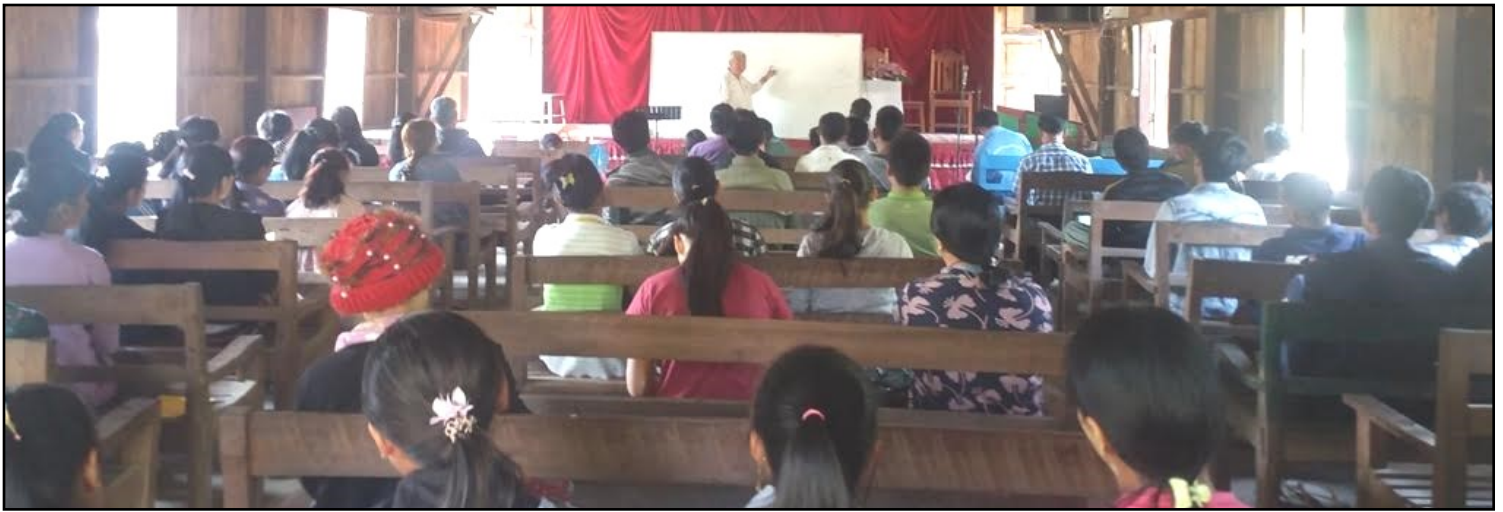
Meeting with the Naga Evangelism Committee

in a big Naga village. So, if the parents would like their children to continue to study at the middle and high school education, they will need to send them to towns. But being so poor, they couldn't afford sending their children to towns to continue their education. For this reason, the Naga Children are also very much in need of help for their education just as the children of the ancestor worshipers need help for their children in Shan State.