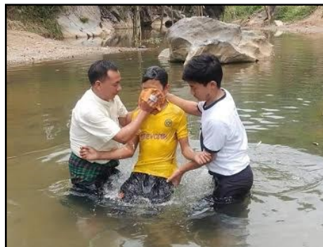
Baptism at Summer Camp

I went up to Nongmung by car to join with the team. It took 4 days (hiking and walking) in the first two decades. The old road is abundant now, every traveler chooses car. We had 385 attendants in Nongmung. We divided into two groups. Their enthusiasm reached higher and higher as the days went by. There were 16 baptisms at the end. Baptism was done in Kasang River as usual.