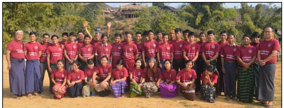
Lehe Leadership Seminar