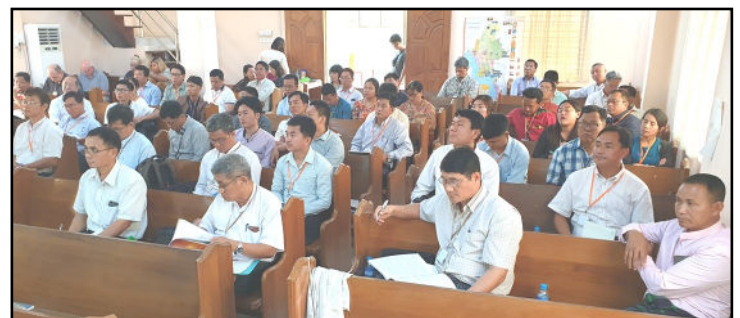
The Kairos Seminar in Process

As I sat in that steamy Burmese upper room, listening to the Kairos course being taught in a different language, my main thought was how amazing God is . We make our plans "for Him," and He goes way beyond what we can ask or imagine. On the day that I counted the number of people in attendance, there happened to be 72 in the room. I couldn't help but think how coincidental it was, given our objective