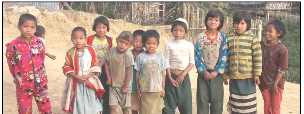
Naga Children with the Hope of Maximum 4th Grade Education

in a big Naga village. So, if the parents would like their children to continue to study at the middle and high school education, they will need to send them to towns. But being so poor, they couldn't afford sending their children to towns to continue their education. For this reason, the Naga Children are also very much in need of help for their education just as the children of the ancestor worshipers need help for their children in Shan State.