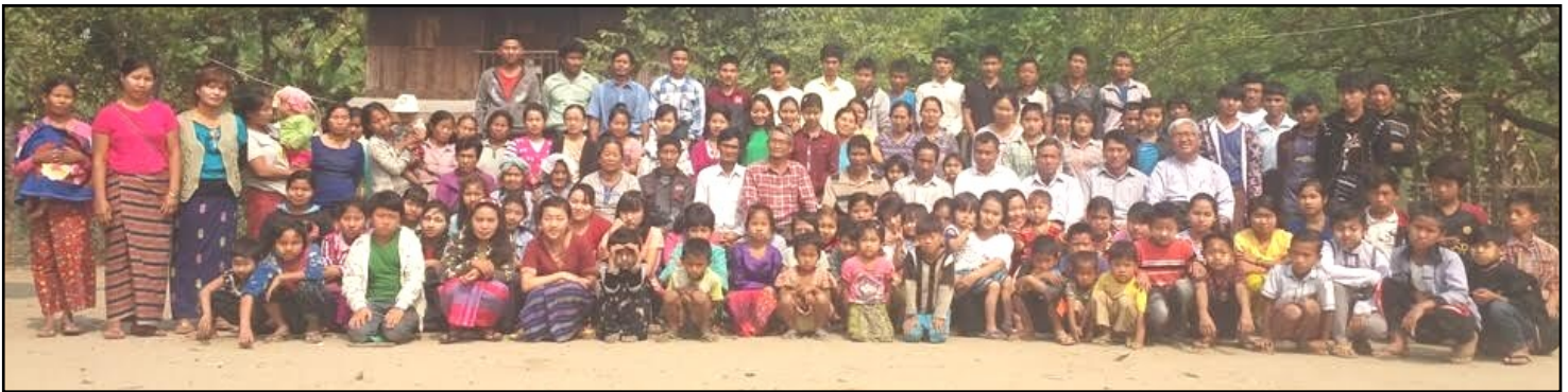
Khamti Leadership Seminar