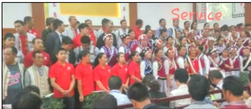
Goshan Church Choir