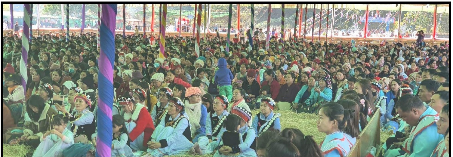
The Gathered Audience

Everything was planned, and yet, it was the unplanned that really grabbed our hearts and brought us to tears. With no running water or electricity, providing for the physical needs of 8000 people who landed on this small village was going to be a challenge. Bamboo shelters were created for people to sleep in the 40+ degree nights. A huge temporary tabernacle of bamboo was created to house the event and keep out the elements. Generators provided the needed electricity for audio/video, including the huge loudspeakers that