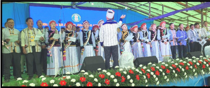
A Lisu Choir