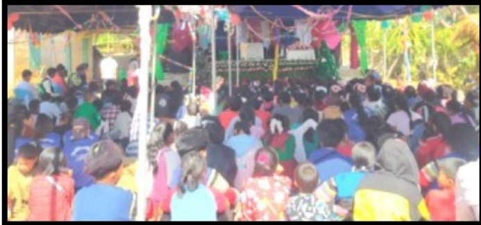
Christmas Worship Service

ancestor worshippers and some from other tribes like Yinnet, Kayah and Shan. The combined Christmas had a great impact on them.