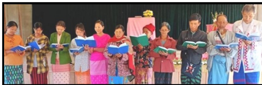
One Box of new Hymnbooks

Christian Literature, such as Bible, Hymnal books, commentaries, etc. Even we cannot go everywhere to share the Good News, and teach, but the Literature message can reach everywhere. THANK YOU LATM!