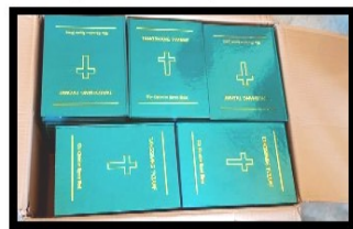
One Box of new Hymnbooks

NAGA people lives in northwest Myanmar and Northeast India. They were reached by our evangelists and planted many churches. It was a great blessing to be partner with LATM for many decades.