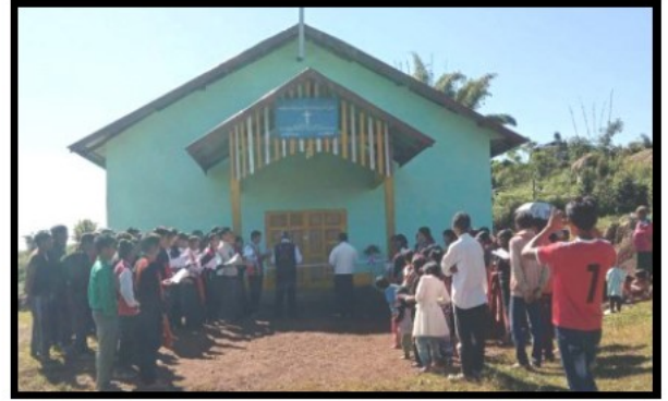
The Yum Dai Church

The construction of new Yum Dai Church was done successfully, and its dedication service was held last October 28.