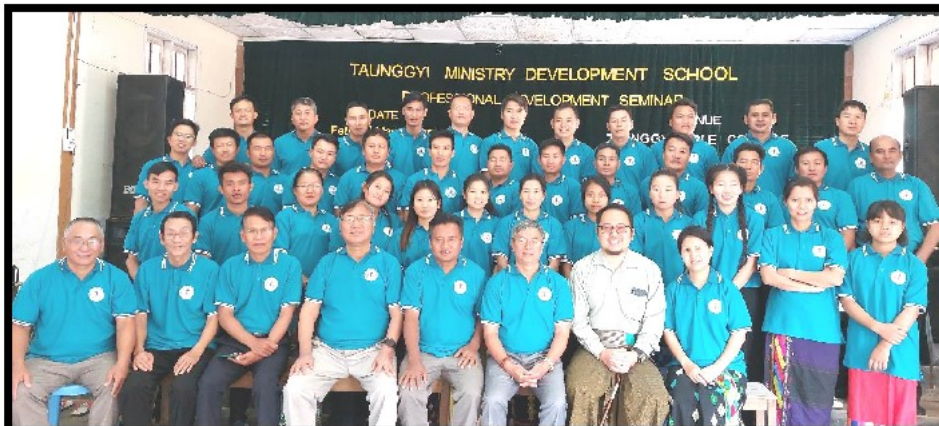
Ministry Development Seminar

The training and development Seminar for about 40 graduates and evangelists from Taunggyi Bible College was held the last two weeks of February. This seminar was to strengthen and encourage workers, pastors and evangelists to continue strong in their ministry. It was a great success.