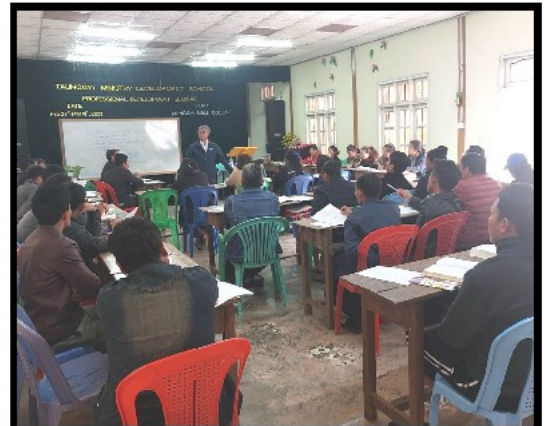
Class in Session