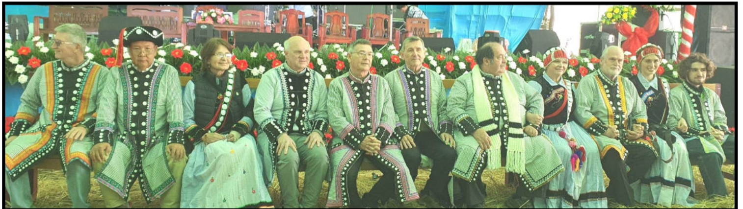
The Morse Family Being Honored by the Lisu People