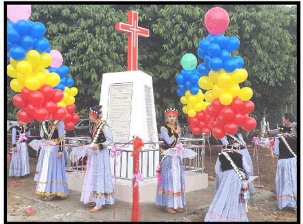
The Monument to Celebrate the 100 Year Anniversary