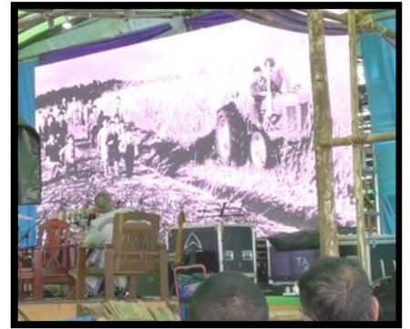
The Lisu Historical Slide Show