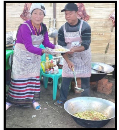
Cooks in the Kitchen

Chorus generations ago. A Christian "rock band" called "The Net" from the capital city of Yangon performed throughout the week, including a fabulous Christmas Day evening concert. They were amazing, and they are being used as a net by God to catch young men and women across Myanmar. Lisu from ages 1 to over 110—many who personally knew J. Russell and Gertrude—were celebrating all together.