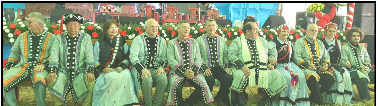
The Morse Family Being Honored by the Lisu People