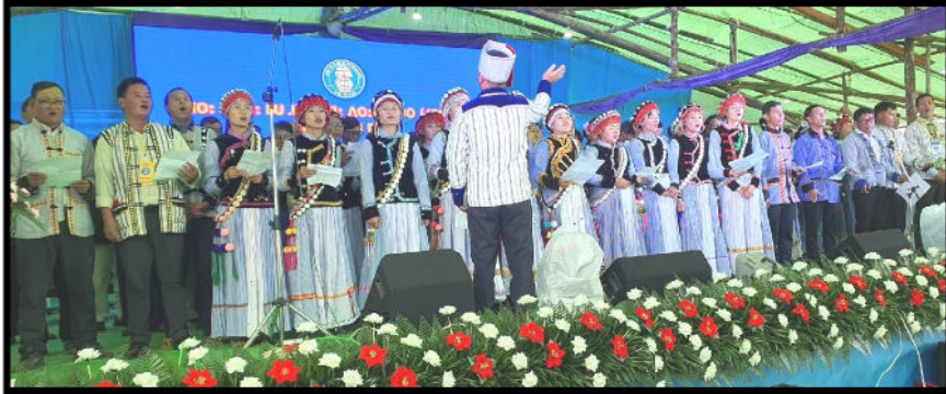
A Lisu Choir

The people sat on straw strewn loosely on the dirt floor of the tabernacle—they sat for 9 hours and more each day, glued to the people speaking and singing on the stage in front. They weren't 45 minutes into "church," looking at their watches and wondering when the service was going to be over. They were here for a week or more, dialed into everything that was happening around them. A 100 Village Choir was composed (can you feel what it would be like to be the person chosen to represent that village?). My Mother, Lois Morse, taught the villagers