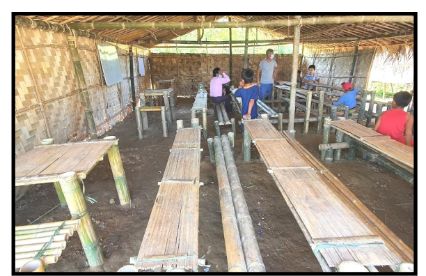
School Classroom with desks

"For the Son of Man (Jesus) came to seek and to save the lost." Luke 19:10