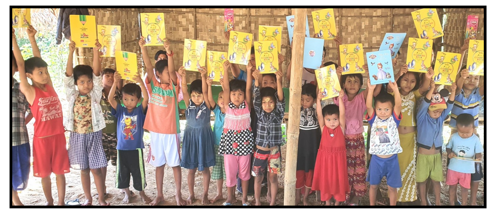
Children enjoying school