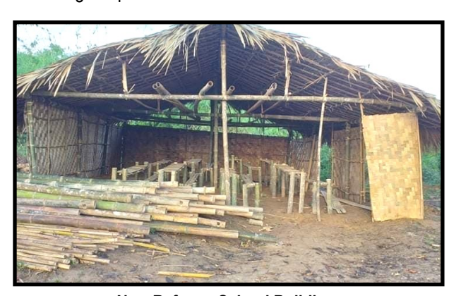
New Refugee School Building