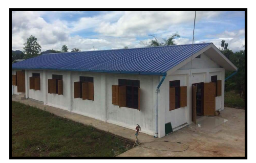
Grace Christian Church

But God wasn't finished. In 2018 we begin to pray and discuss how God might use this partnership in other ways. What came out of