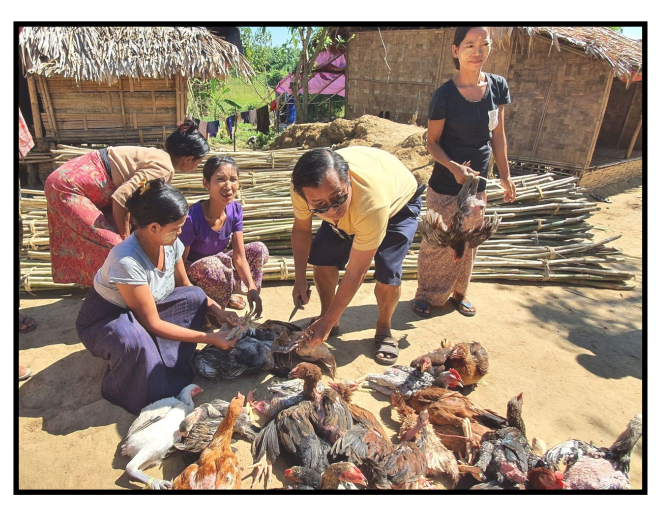
Distributing new chickens