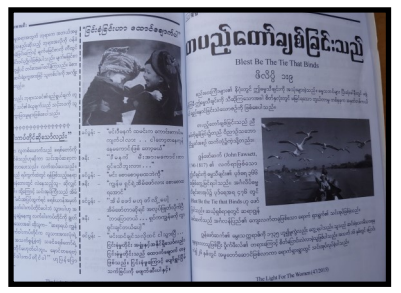
Christian Women's Magazine