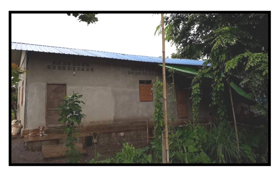
Three Pagodas Christian Church