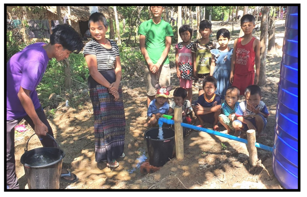
Life giving water