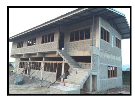
Immanuel Christian Church