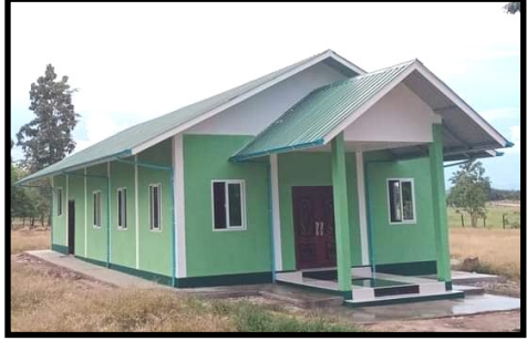
Myatlay Kone Christian Church