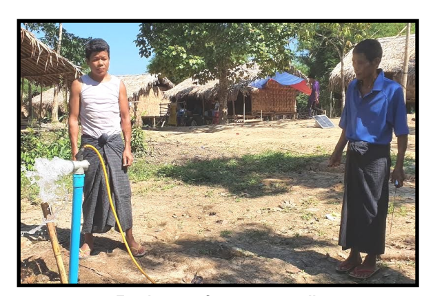
Fresh water from a new well

Fresh water is one of the great needs. We were able to Drill 7 Wells for refugees and villagers.