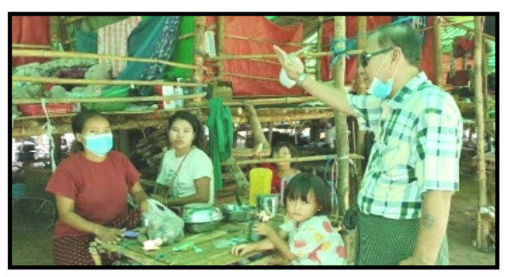
Giving Thanks for God's Provision