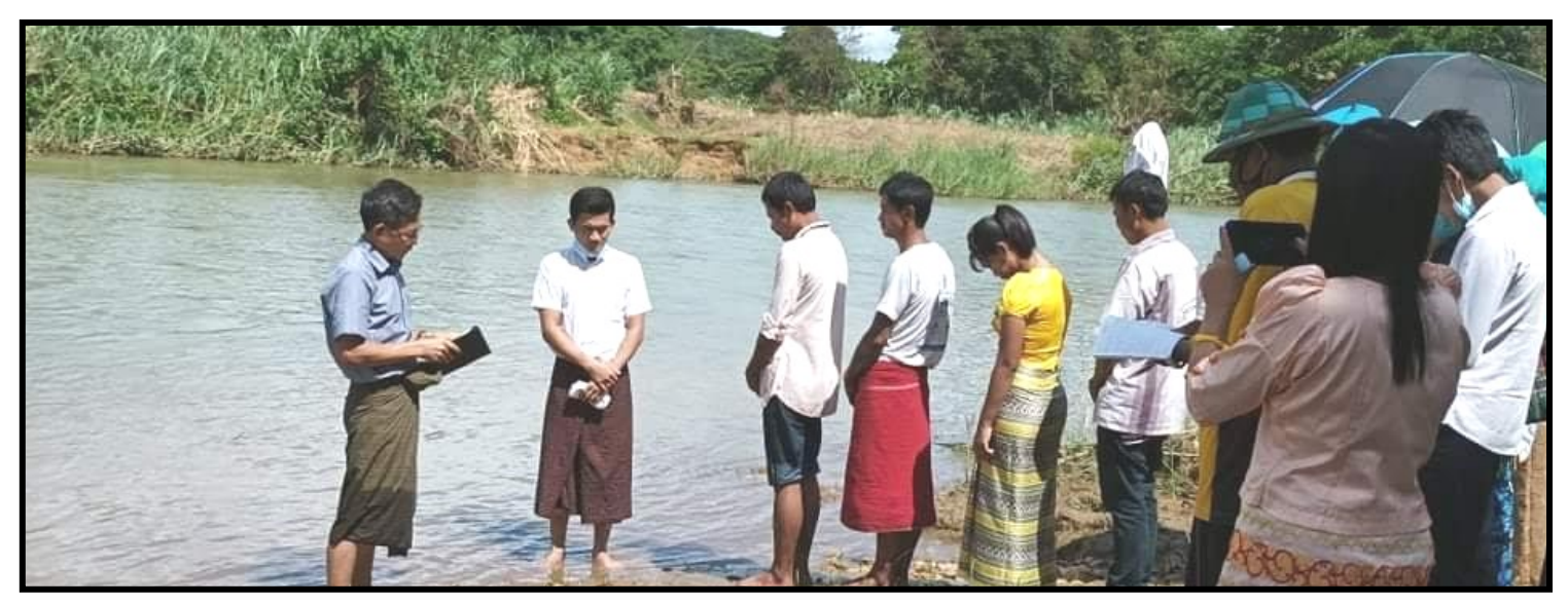
Four New Believers

It's always a joyful heart to share with you about how God is doing great things in His ministry and extension His created people. Today, on September 4, 2021, the Lord brings four new souls. They accepted Jesus as their personal Savior and