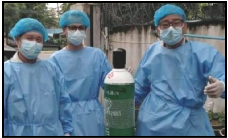
Covid Medical Relief

Medical care and Prayers are the key to heal their physical, mental and spiritual sickness.