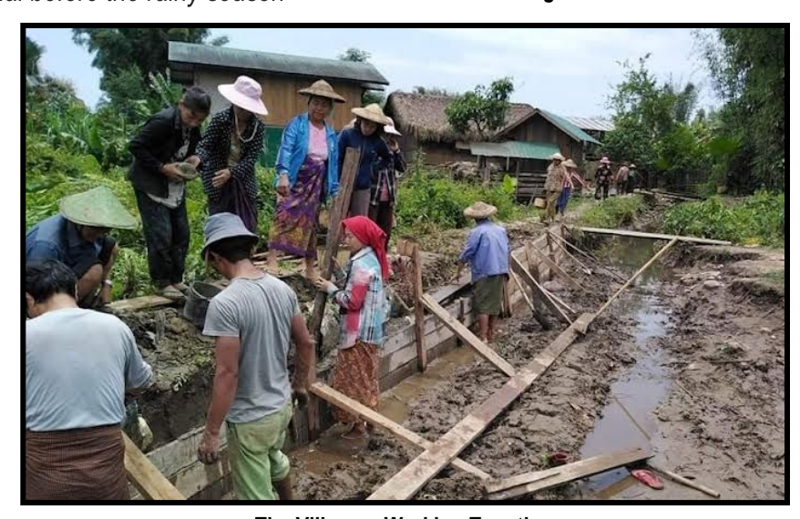
The Villagers Working Together