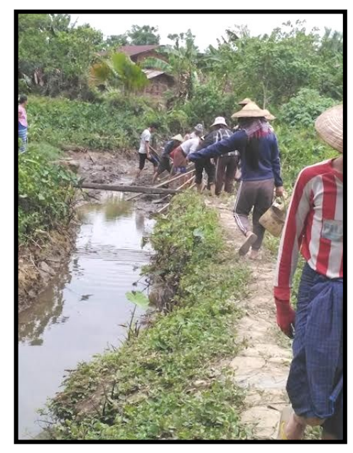
The Irrigation Canal