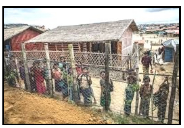
Children in the Cox Bazar Camp

Since 2017, 750,000 refugees have fled persecution and mass killings from the Burmese Military (more than 10,000 killed) and crossed the border into Bangladesh. They have relocated to the Cox Bazaar area. The refugee areas are fenced in by chain link and barbed wire. The Rohingya