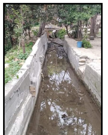
Retaining Wall Completed

ACS used funds from our General Fund for this project.