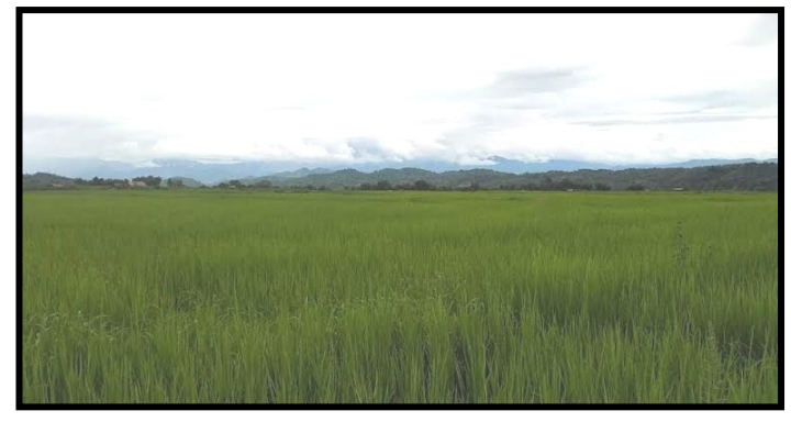
Paddy Field is Flourishing

He told me that even the widows and orphans are so happy that they are saying that they didn't get enough rice last year