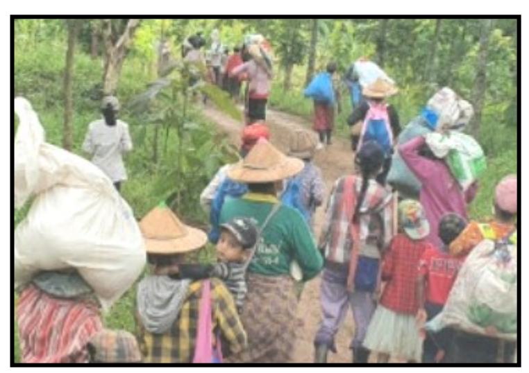
Refugees Returning to the Jungle with Food