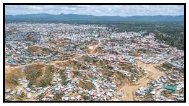
Cox Bazar Camp

people in this camp have faced one horrible situation after another.