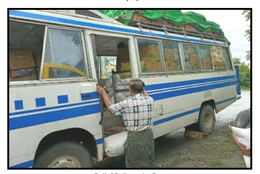
Relief Delivery by Bus