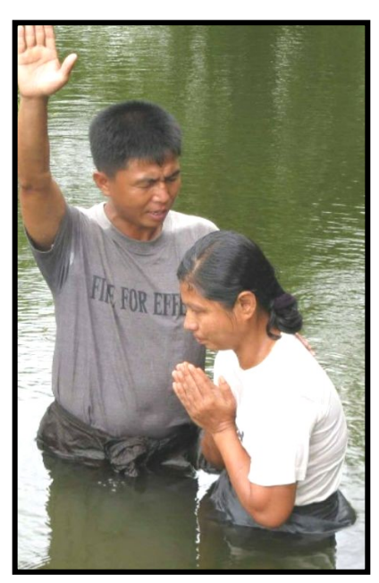
A Lost Sheep is Found

Thank you so much for your partnership, love, and prayers. Let's continue to obey and follow Jesus' teaching to GO, HELP & SAVE THE