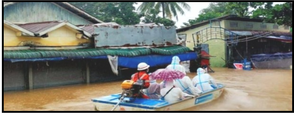
Flood Relief in Covid

We are suffering CCF triple disaster: Coup, Covid, Flood and living in unsafe situations. This is the darkest days and there are shooting, bombing, violence daily. The people are hopeless, helpless, and struggling hard for life in this pandemic time.