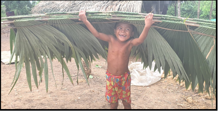
Helping with a new roof