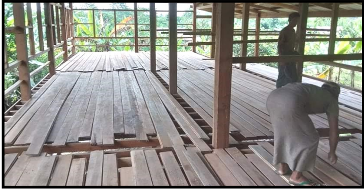
Drying The Floor Boards

Sept 9 - The contractor and his men have done smoothing the timbers. The timbers are not completely dried yet and they spread them on the upper floor to get dried.