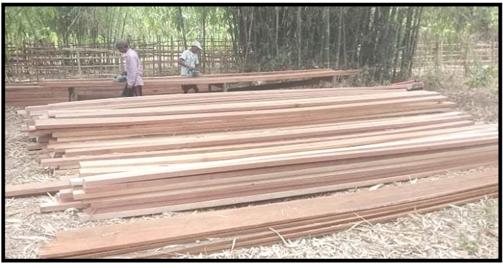
Notching the Timbers

May 12 - They have done smoothing and notching the woods as far as now. Next Thursday or Friday, they will raise the wooden poles. Please keep praying for the project.