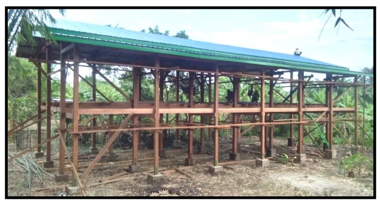
Finishing the Roof

May 23 - They have done putting the zinc roofing for the Training Center building successfully today. But we need to do a lot for the inside of the building. Please keep praying for them. This year, I would say that the rainy season comes early but having done putting the roofing is a great success for us because we don't need to worry about the rain. Under the roof, the construction of the inside part of the building can be done. Praise the Lord. Thank you very much.