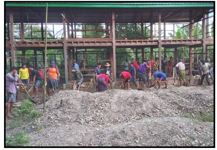
Working to Make the concrete Floor

Fortunately, through the Lord's grace, till now, no Covid-19 case is being tested in Khamti and Lehe areas. So, our Naga students are working hard in spreading the gospel. I thank God for that. Please remember us in your prayers. We are also praying for you.