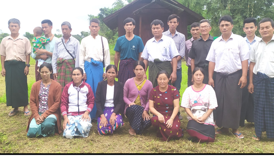
Khamti Shan Christians and Missionaries

1. New Testament; We are printing it and we hope we will receive it this coming November.