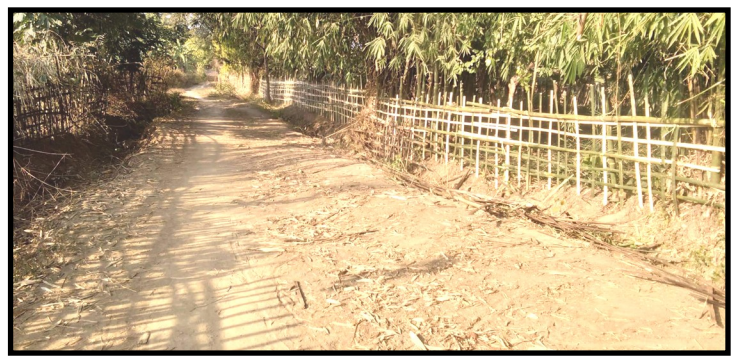
Seeing the new Bamboo Fencing

February 13 - The villagers are so happy to have the school in their village. The villagers actively volunteered in putting a bamboo fencing around the campus. There are also many bamboo groves growing on the land and thus, we don't need to buy the bamboos from outside.