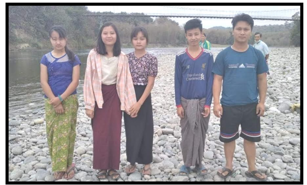
5 baptisms after VBS near Putao

From Jeremy Leme: Today's activity! Five souls won to Jesus and baptized this morning. Safety is poor and we didn't go to river, but just done at the bathroom! Praise God!