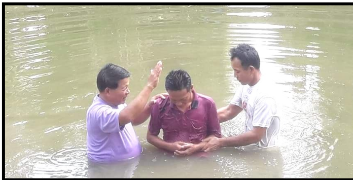
A new life in Christ

them. Our team reached and baptized 18 new converts. God's Kingdom is expanded. Thank you for your love to God and us. It makes a difference, and we impact the world by our love Action. We covet your prayer support in this challenging time. May God Bless You!