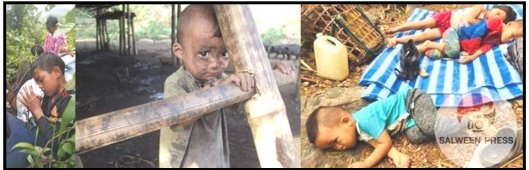
Loving the "Least of These"

Our ACS team will share the love of God, along with the aid, to those who are so desperate. Our God will do the rest!