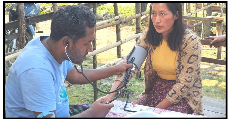
Providing medical care