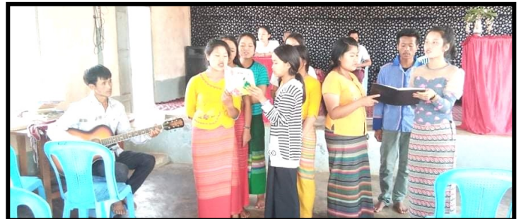
High Park Church youth praising with new guitar

Thank you very much for your providing guitars for the church youths. I asked them to use them in practicing songs, praising God and in teaching the youths guitar skill. Now, the youths from the churches were so much encouraged by your donation of guitars. Because they are too expensive, they couldn't afford such good quality guitars. I also asked them to use it with care and they are using them with great care. So, the youth ministers are using them at their best.