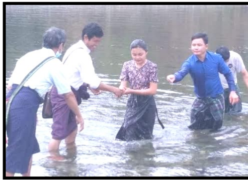
Baptisms at the Mula River after VBS