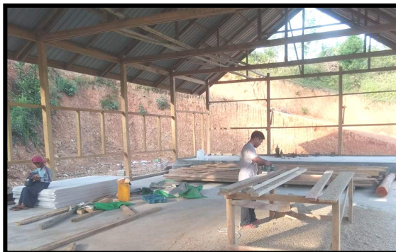
The inside of the church

...The Lehe church minister and church elders reported that they have done putting the church wall and now they just need to put the main door and window sheets. After that, they will have done it completely. They are so thankful for the donation!