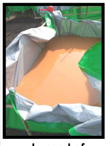
In need of clean water