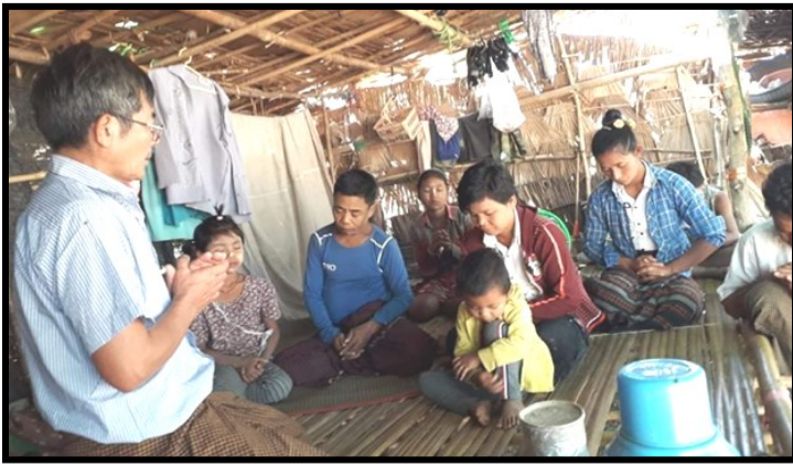
Meeting spiritual and emotional needs

the situation. Many preachers and church leaders are rising to meet some of those emotional and spiritual needs.