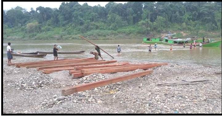
Unloading the timber from the ship