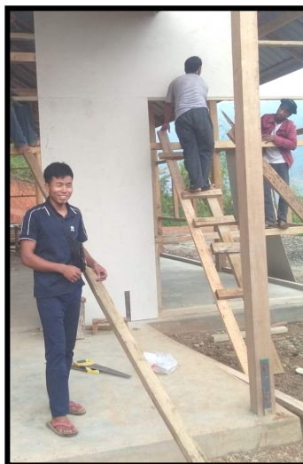
Installing the wall boards