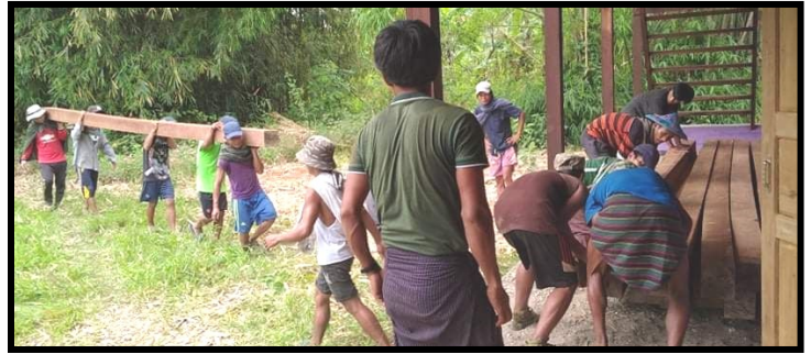
Gather the wood to the Center