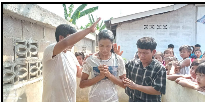
Moses baptizing 6 refugees