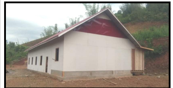
Lehe Church, the back view