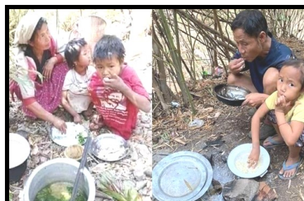
In need of food

The people are desperately needing food, shelter, medicines, and good water. They also need loving care to deal with the trauma they are feeling and the hopelessness of