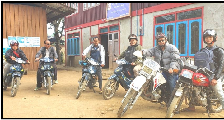
The Missionary Team of Six