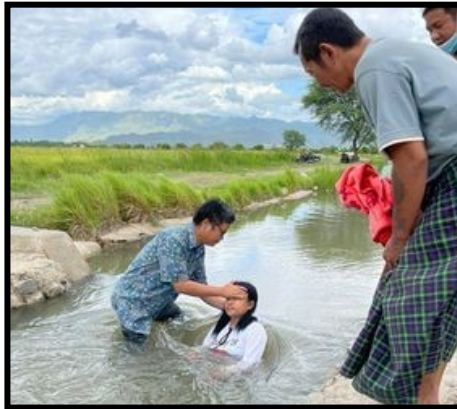
Baptism in the river

From Jeremy Leme: Today's activity! Five souls won to Jesus and baptized this morning. Safety is poor and we didn't go to river, but just done at the bathroom! Praise God!