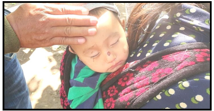
A child needing care

us. Some went to hunt for food for guests. Some brought smoked jungle rats for VIP guests. It is awesome to see their generosity and love even though they are very poor.