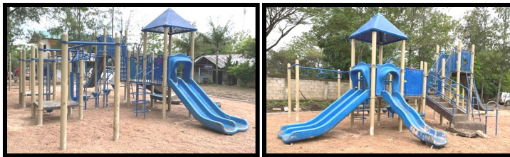
The playground at Immanuel Church and School