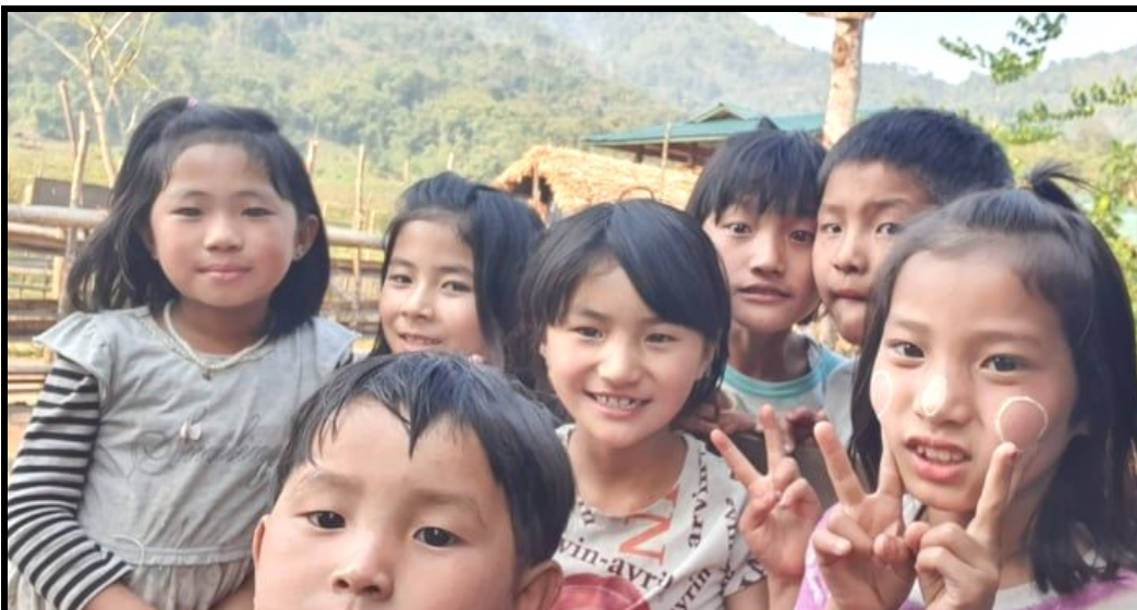
Beautiful Mountain Children

The villagers went to the Mula stream and fished 20 pounds for