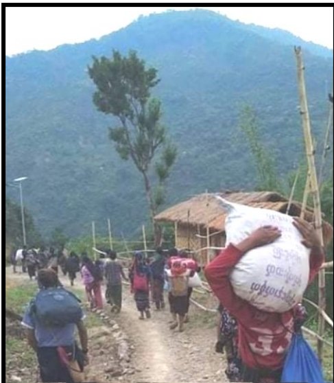
Fleeing and leaving all behind

Military soldiers are burning homes and markets, randomly shooting into homes that are occupied and giving airstrikes that level whole villages. The villagers are escaping, leaving everything behind, including their animals to find shelter in the jungle. Military bombings and fighting between ethnic armed groups have destroyed many homes, driving thousands of families into hiding in Kayin, Chin, and Shan states.