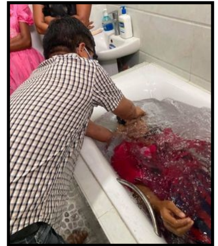
Baptism in a bathtub