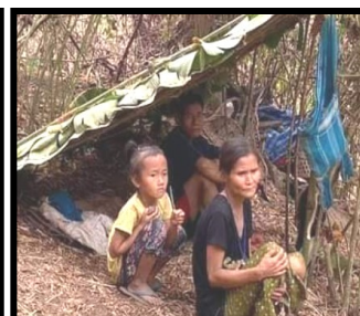
In need of shelter