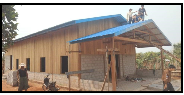
New Keng Tung Church