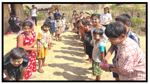
Playing in IDP Camp