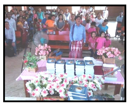
Celebrating the New Hymnbooks