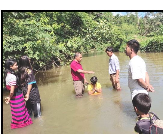
Baptism of Animist Worshiper

Our team has persevered through the trials. The spiritual fruit that has been produced through their experiences has been