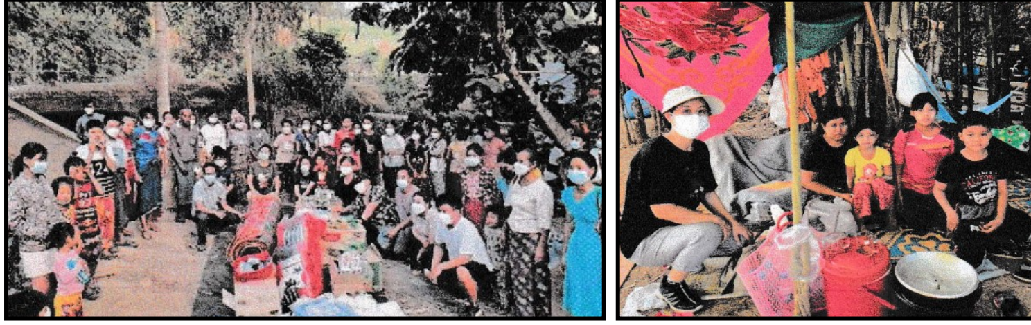
Refugees at the Myanmar/Thailand Border

After the military took power in Myanmar early 2021, hundreds of thousands of people became Internally Displaced People and refugees in Thailand. By the support of IDES and the partnership with Rapha International, ACS Thailand has been helping with food and other emergency aid to refugees at the border of Thailand-Myanmar. Thank you IDES for your great assistance with this need. – Tasanee ACS Thailand