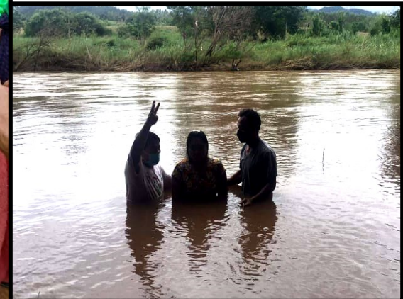
Baptism of Buddhist Refugee