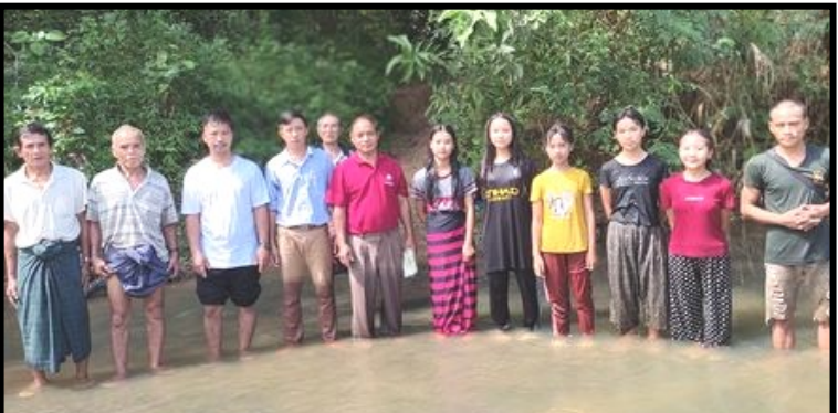
Paul and New Believers