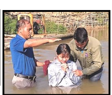
Paul Baptizing New Believer