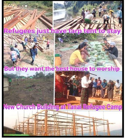
Building a Church in the Refugee Camp

We have free lumbers, and the refugees are volunteers to build this church. We are building this church from the the contribution of Bring Good News International. The donation is building a 40 X 60 church building. The refugees are volunteers, giving free labor and saw the lumber to prepare church building. They are dedicated, leaving their huts, tarp tents and work the best for the church. The refugees are very poor but rich in spirit. They want to build the best house for the Lord to worship even though they are living in hut with tarp roof. We still need US $1,500 for zinc roof sheets instead of tarps. Hope and pray that God will provide. Blessings. - Simon