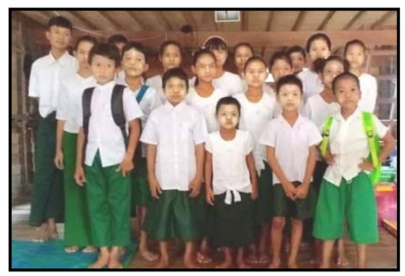
The Children ready for School

Being in among the indigenous people, it is tough to grow immediately. I am sowing the seed competently. The Lord is leading the church in different ways.... Now the church had moved to a new location. Two families came along with the church and 5 students. So we can say that ten came from Langan. There are more people wanting to move. I am the one who made the decision in God's grace. Now we are new place. The older