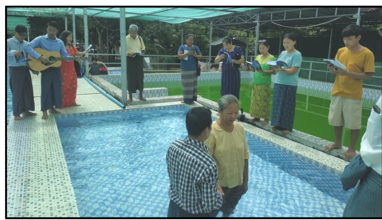
Baptized into Christ

This is the testimony of a new believer who has been added to our church during these three months. She said that the life between Christians and the unbelievers are totally different. Even her own relatives ignored her when she was in trouble. But she received the love and care from the Christians that make her wonder why strangers are really