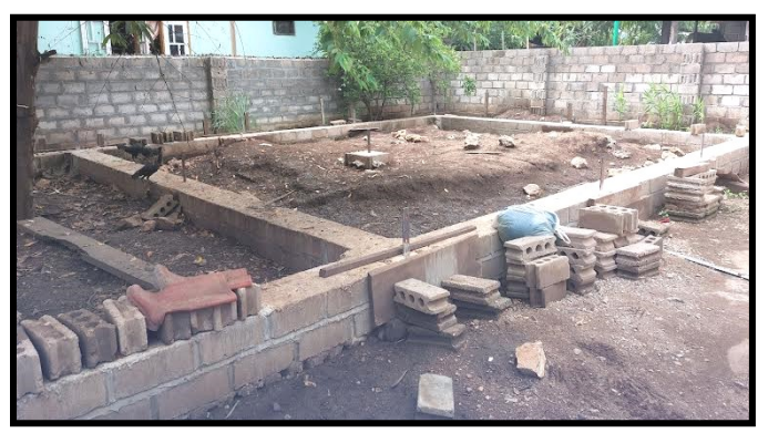
Linn Hkay Church Sunday School Building

Concerning Linn Hkay church, I would like to share a need for their ministry. They have been collecting funds to build a Children Sunday School Building