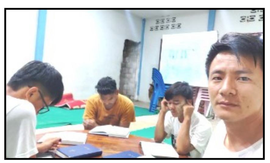
Teaching Worship Song and the Bible to the Children