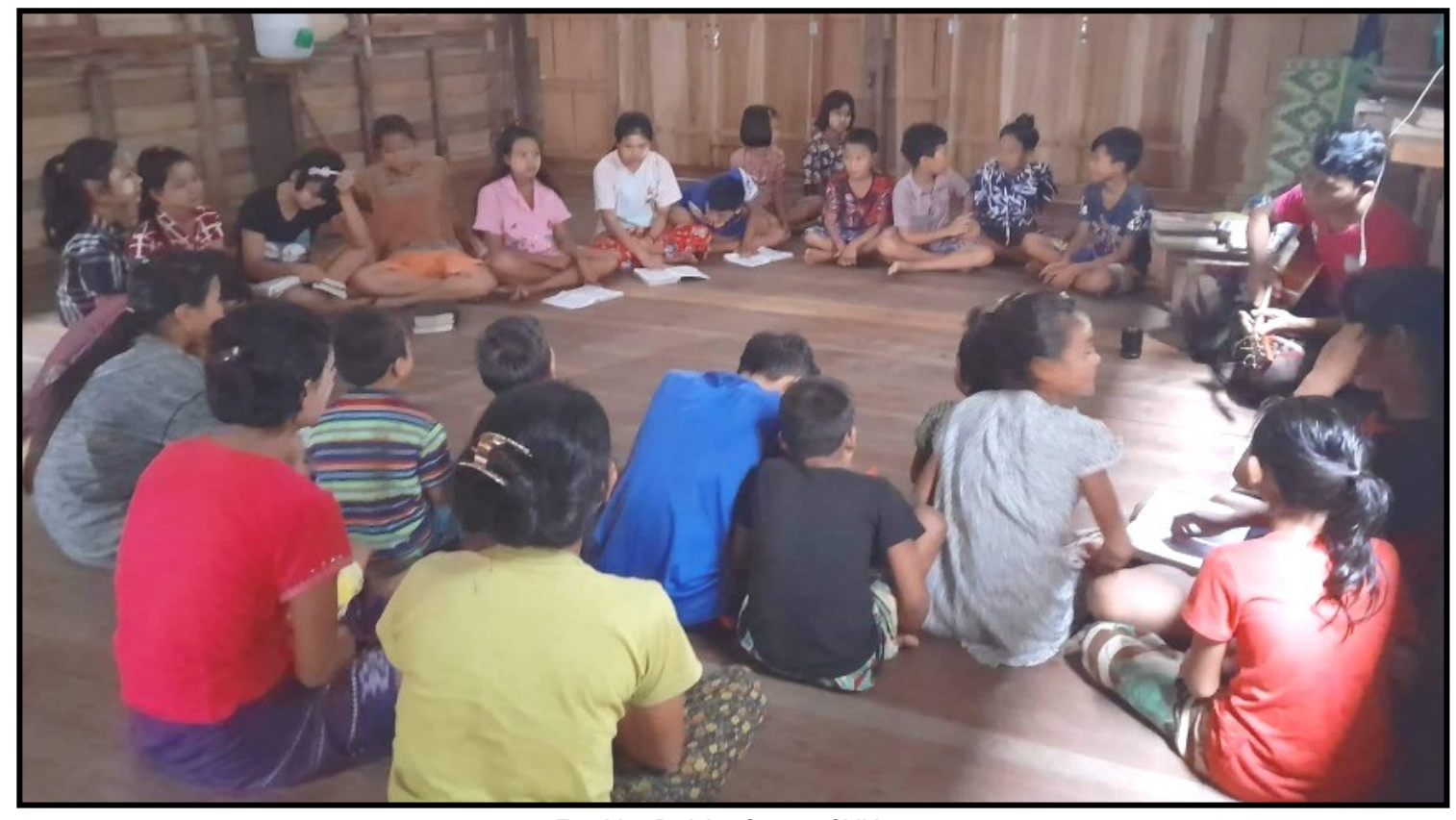
Teaching Praising Song to Children

place now. Once, we were wandering one place to another. That created many difficulties, and the people