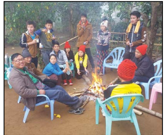
Warming Ourselves in the Morning