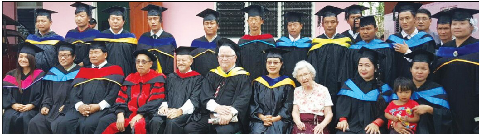
Discipleship Graduation at MaeSod

and served over 20 years) at Discipleship Training Center, Maesod. 20 Disciples were graduated.