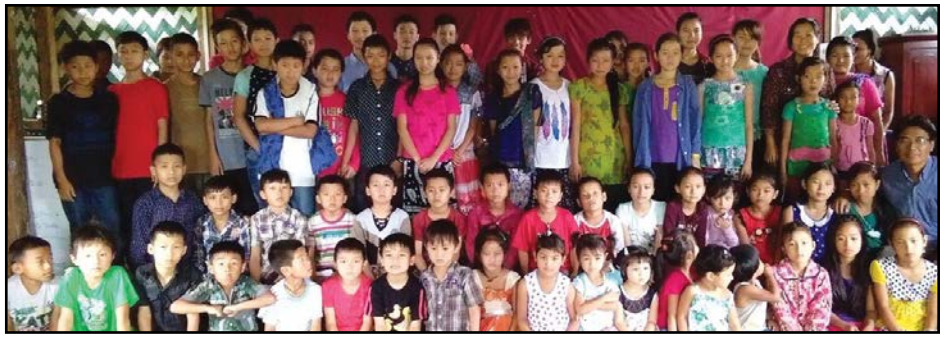
VBS in India