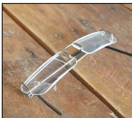
A New Pair of Glasses