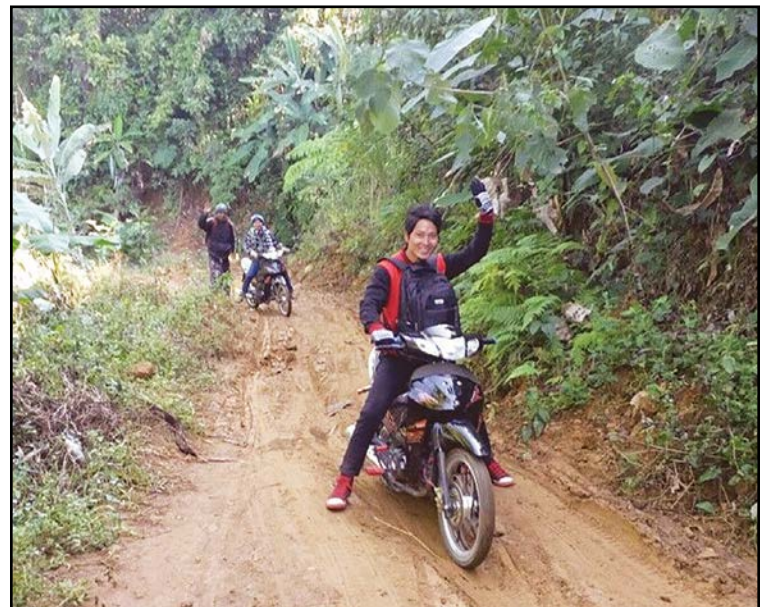
Evangelist on a Motorcycle