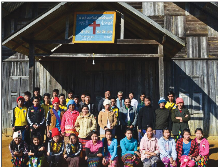
TBC students and the Church Elders and Deacons from Mar Main She De Church