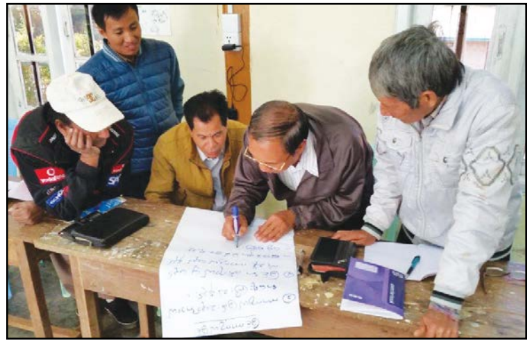
Health Education at TBC with Pastors and Community leaders.