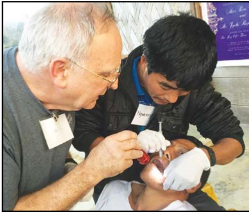
Preparing to remove a tooth.

is the ministry leader. In the past five years, we have trained 17 of his ministry workers in dental extraction. All of the students are still part of the ministry and still using their dental skills to serve others.