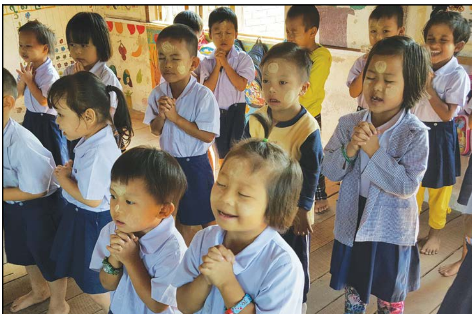
Buddhist children in preschool praying to Jesus.

Parallel to that strategy, research has provided a piece of information that 85% of everyone who is currently a follower of Christ made their decision to follow Jesus between the age of 4 and 14 years old. With that news, STADIA’s mission has now emerged “to plant churches that intentionally care for children,” and as God blesses the accomplishment of that mission, STADIA’s vision is “every child has a church.”