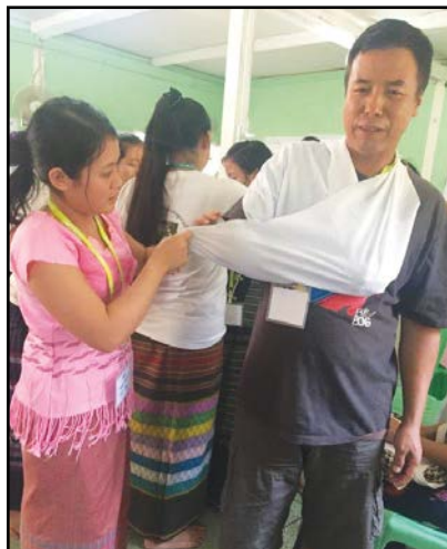
Health Education at Hope Orphanage -- practicing treatment of fractures.

The team then traveled north to Shan State and taught a