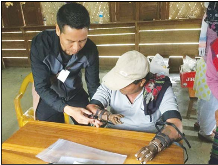
Attaching a new limb.

mPower Approach has been encouraged by the people of Life Care Foundation and their vision for the capturing of the hearts of remote India for Christ.