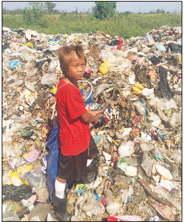
Young boy working at the trash dump camp in Mae Sot 2017

While in Thailand and Myanmar, our FAME teams joined ACS missionaries who serve selflessly, faithfully, and tirelessly each day of their lives to bring honor and glory to our living God. There is no other place I would rather be than serving alongside men and women of this caliber.