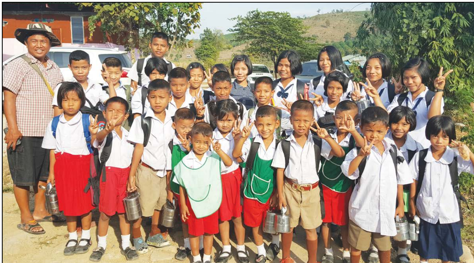
Refugee children at Mae Sot

In that context, STADIA was able to establish a partnership with COMPASSION INTERNATIONAL in South America. COMPASSION agreed to sponsor 200 poor children as an outreach through every church that STADIA planted. That work is continuing to this day and over 120 churches have been started with that model in South America in just 6 years' time. STADIA funds these church plants through generous partners, including new churches in the US, more established churches, and generous donors. COMPASSION facilitates the child sponsorship programs from donors around the world. And even more broadly, child and youth ministry has now become a key part of STADIA's church planting efforts everywhere.