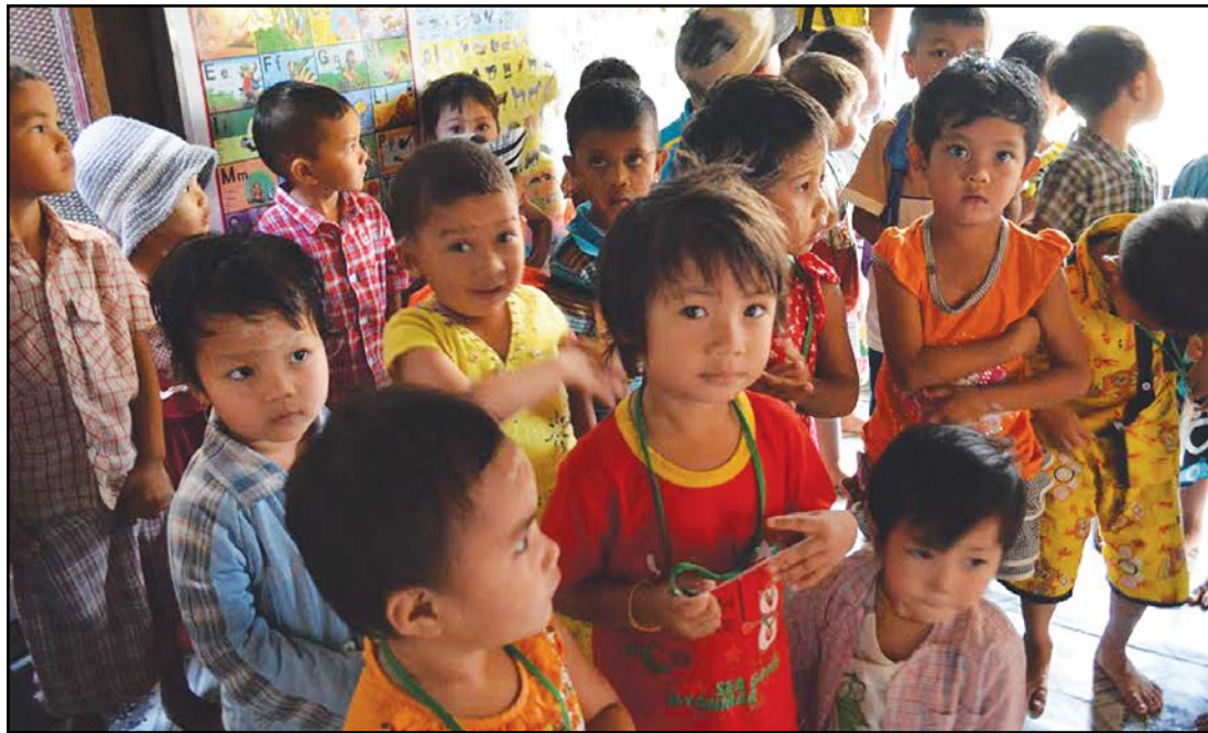
Preschool supported 12 years by two ACS families.

Burma and Thailand in 2017. ACS will be securing funding to sponsor as missionaries those new church evangelists and preschool teachers. The 40 unreached tribes have received a new open door to the gospel. All of this is a true blessing and we are certain, a gift from our Heavenly Father. If this can prove to be an effective strategy, this partnership could be continued into the long term future.