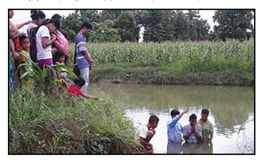
4. A NEW CHURCH AT PHAYATONSU, THAILAND BORDER - God's Kingdom is expanded through your prayer support. We baptized 9 new converts in

3. BAPTISMS - We sow the seeds. We water. God makes it grow. Our team baptized 7 new converts this month. God's Kingdom is tremendously expanded by your prayer support and partnership.