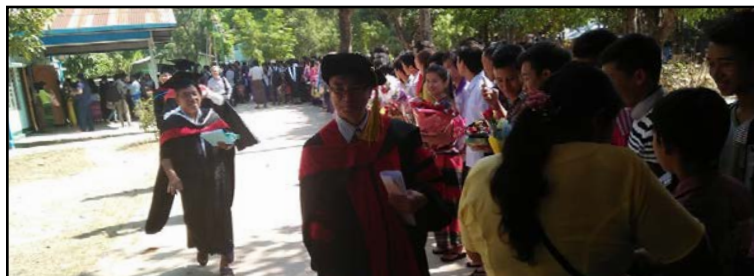
These audiences lined up to greet graduating students after graduating program was over