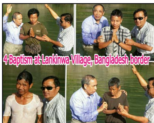
4 Baptism at Lakinwa Village, Bangladesh border