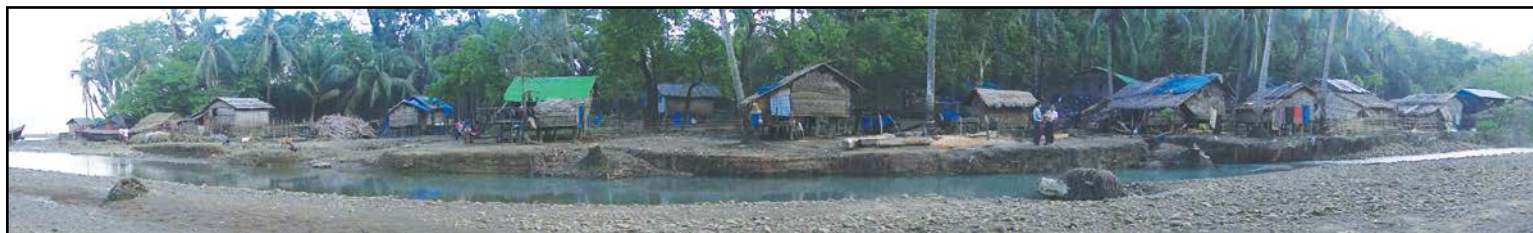
Mya Dae village after the flood