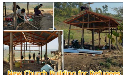
New Church Building for Refugees

3. WATERFALL CHRISTIAN CHURCH - Waterfall village is located Thailand Myanmar border. Our Evangelists reached this village by teaching their children. Seven family accepted Jesus as Savior and one family gave 1 acre of his farm for Church. We prayed for this family and started foundation. The villagers are volunteers. P.S. We finished and dedicated the building through donations from the FAME Medical Team in January.