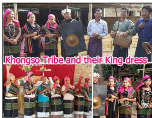
Khongso Tribe and their King dress