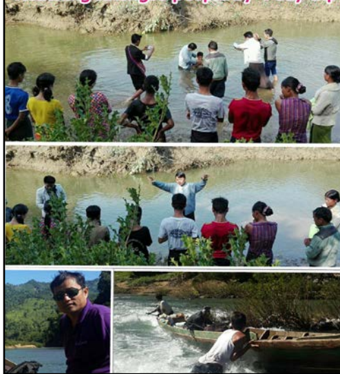
Lakinwa Village, four day trip