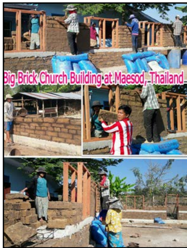
Bethany Christian Church in Maesod