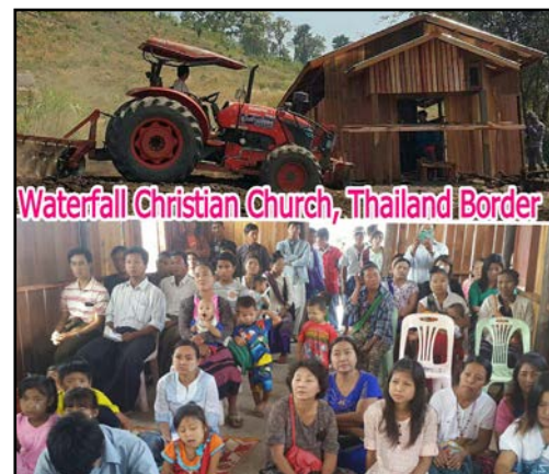
Waterfall Christian Church, Thailand Border