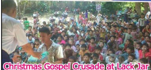
Christmas Gospel Crusade at Lack Jar Christmas Home Church in Lackjar

2. LAKINWA CHRISTIAN CHURCH - It takes 4 days to reach this Lakinwa village as it is located Bangladesh border. We took one day flight, one day bus in the dusty road, and 2 days by boat without roof and