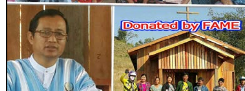
Waterfall Village Church Donated by FAME