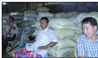
Buying rice bags at Bungna Kuhn