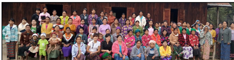
The 2nd Khamti Christian Women Seminar