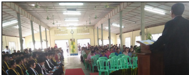
Graduation of EBI and ECBS with our guest speaker