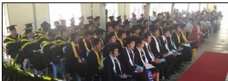
EBI Graduating students in the front roles waiting for their certificates and diplomas