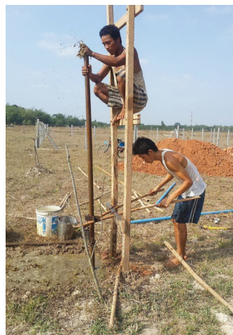
Drilling water well