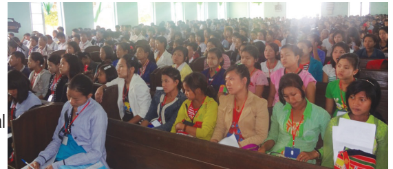
Youth Conference 1

We divided the youths in two groups, one group in church building and another group in the Church hall and we conducted the teaching. Through the Lord's grace, the youth conference was also more than successful. It was a place of encouragement, fellowship and unity for the youths from the difference churches. I was also requested for next year youth conference also by the committee of youth conference. I sent some pictures of the youth conference and my teachings. Thank you very much for your prayer and support. God bless you."