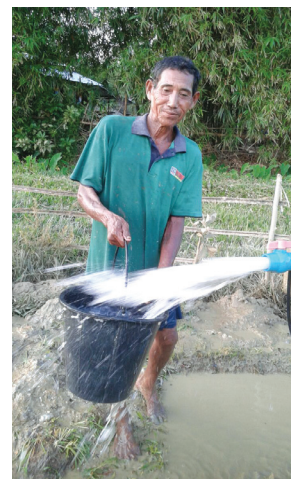
Giving fresh water