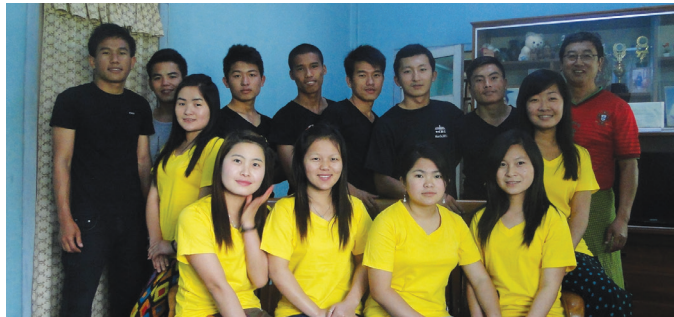
A Team of Youth Camp