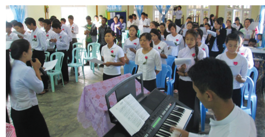
New School Year at TBC

A continual need - We send funds to scholarship Bible College students at $15- $20 a month for 10 months a year per student depending on the location. This covers room, board and books. This means a Bible College trained church planter's education is $600-800 total for the four years of study. We feel there is not a more cost-effective mission dollar spent.