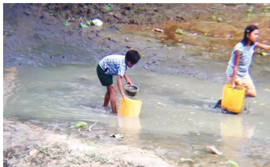
Very bad water