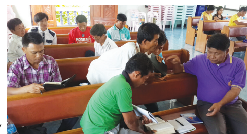
Simon Conference 2