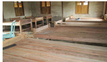
New sleeping beds for girl students in the new girl's dorm

A fairly regular request - A training event can be held for a week and the cost for 125-150 evangelists will be $3,000-5,000 that covers everything: Food, housing, and transportation costs. Sometimes a request is made just to buy the rice for the conference or just to pay for transportation. At some events, the participants walk sometimes two weeks one way to attend. They might drive the pigs with them to provide the meat for the conferees. Their dedication to Christ and, their love for the people - both those still lost and those who have been incorporated into the church - is an inspiration to us. We are delighted to share the financial load with them to ensure their further training and encouragement.