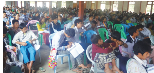
Youth Conference 2