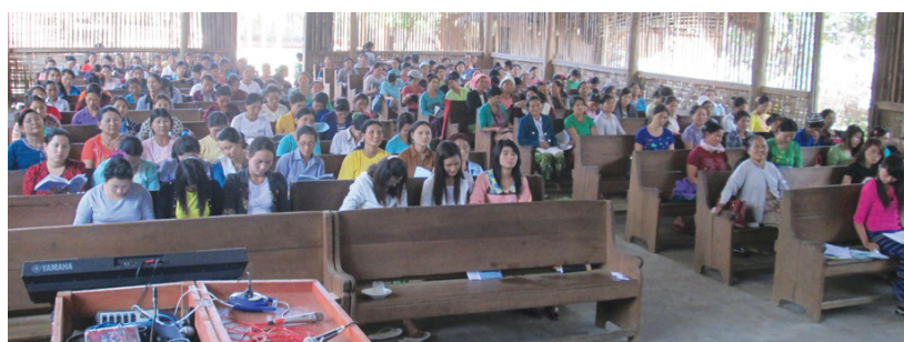
Christian Women's Seminar