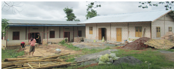
Seeing in full view of the first and second girl's dorm

An annual request - Big building projects for a church, meeting house, or a Bible College building can often be funded from $1,000- $7,000 depending on the project and the location. We are so grateful to Ruth Morse Johnson, who recently funded a college chapel and a dormitory at Taunggi Bible College. These buildings will help greatly in the expansion of that good work and they were finished by the start of classes.