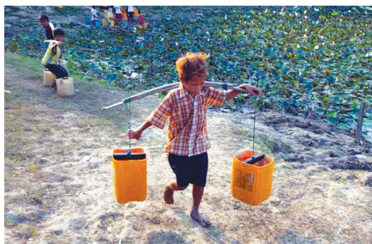
Children carry the water