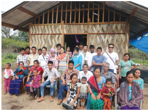
Nathaney -- New Church

"I am very happy to send a few photos of the ministry we do here in Arunachal Pradesh, Northeast India. On 10th May 2015, the new church at Punyabhum village was inaugurated. Now the villagers have a place to worship God. They were very much excited. The villagers collected bamboos for the wall. The rest of the needed materials were given by Community Church of Christ Miao.