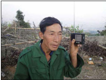
A Chinese Lisu Christian leader enjoys listening to his new shortwave radio presented by ACS workers