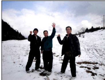
ACS Team on their way into China to visit and encourage Christians there and to share radios and mp3 players