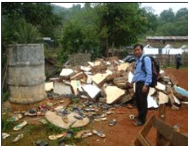
Above, 25 people died in the collapse of a church building reduced to rubble - some of the results of the most recent earthquake in Tachelik City, Myanmar.