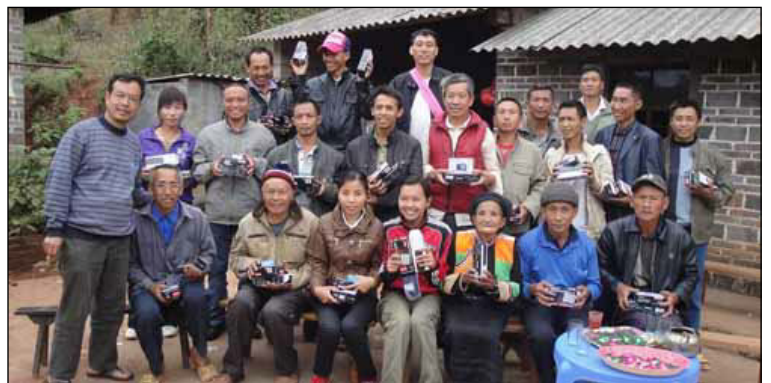
ACS team above had never been to this area of China before - and rejoiced to fellowship with local Christians and church leaders.