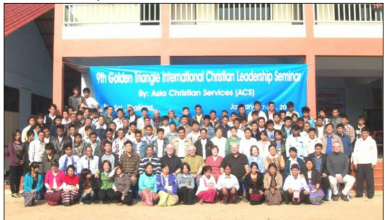
Below, the Golden Triangle Leadership Seminar participants enjoyed the classes and worship sessions held in Mae Sai, Northern Thailand.