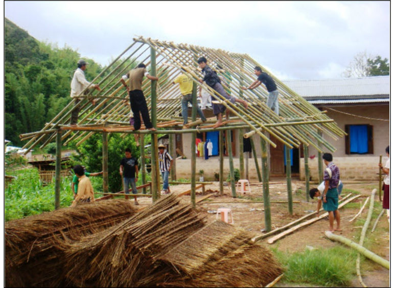
Workers build a new bamboo dorm for female students attending Taunggyi Bible College in Central Burma. Long-time co-worker Manasseh Fish serves as President and reports 32 female & 34 male students. $1,000 will pay for this structure and provide needed beds, benches and desks for new students.